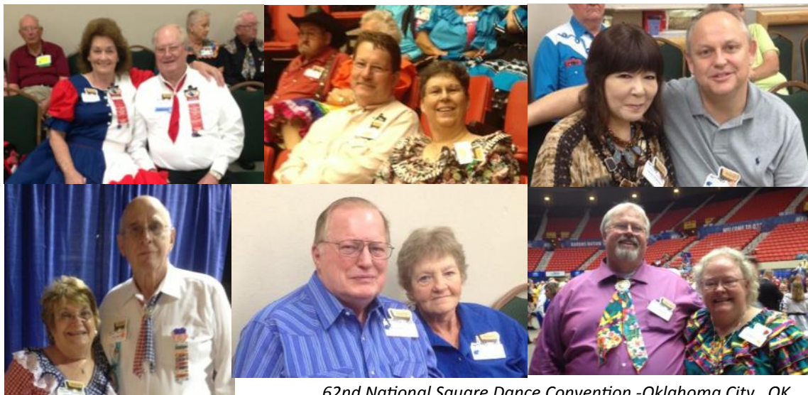
62nd National Square Dance Convention -Oklahoma City, OK