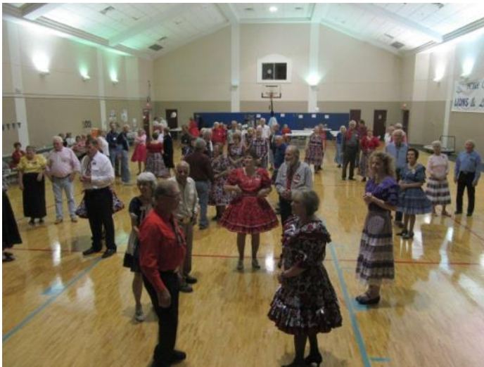
Graduation 2013