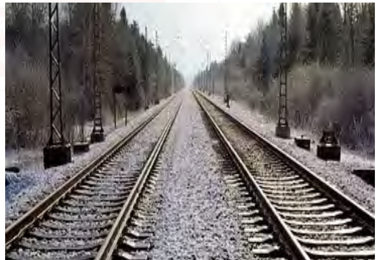
Last month's picture was Recycle